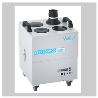
Fume extraction devices