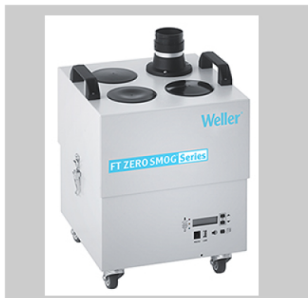
Fume extraction devices