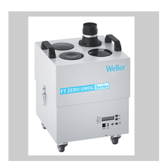
Fume extraction devices