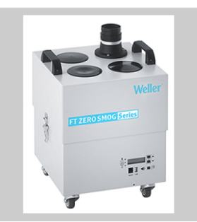
Fume extraction devices