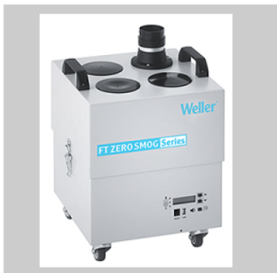
Fume extraction devices